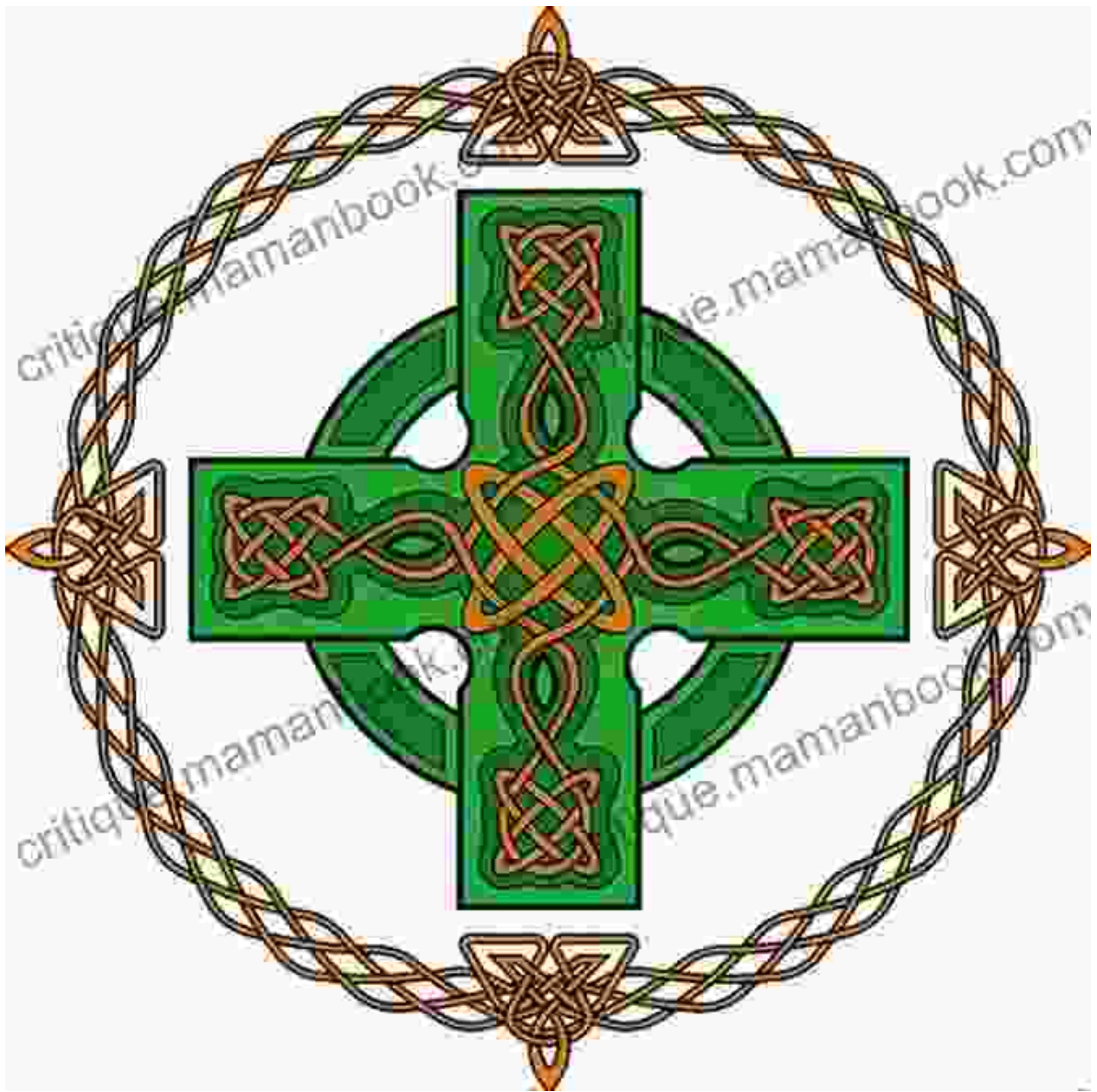
Celtic Cross Symbol